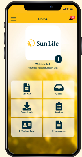
Step 4 Enjoy using SunAccess effortlessly, anytime and anywhere!